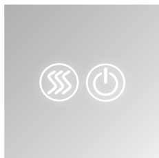
Touch sensors for light and demister